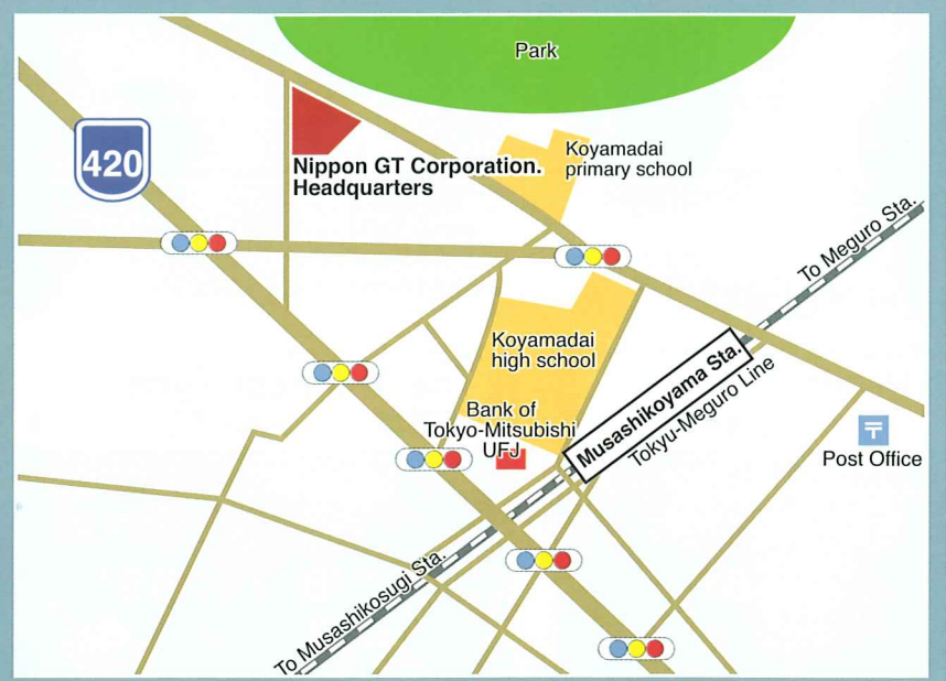
Access 7min walk from Musashikoyama Station of Tokyu-Meguro Line.

3-12-15 MEGURO-HONCHO, MEGURO-KU, TOKYO, 152-0002 JAPAN TEL : +81-3-3713-7124 sales@ngt.co.jp FAX : +81-3-3794-0585 http://www.ngt.co.jp